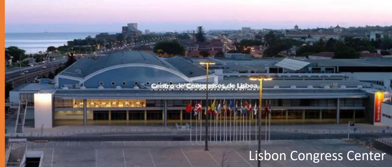
Lisbon Congress Center

The Lisbon Congress Center is located close to the river Tagus and the historical and cultural heritage of Belem, just a few minutes from the city center, in a prime area with a vast transport supply. It is a comfortable venue for the staging of congresses, conferences, business meetings, fairs, exhibitions and other events.