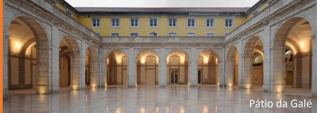
Pátio da Galé

The Pátio da Galé, which opened in 2011, is located in the west wing of the Terreiro do Paço (The Palace Square) in Lisbon, where the Royal Palace and the Casa da India stood before the earthquake of 1755 struck.