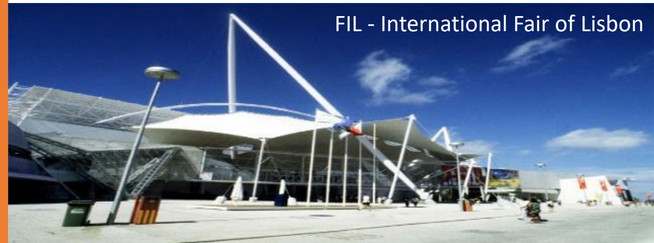
FIL - International Fair of Lisbon

The Lisbon Congress Center is located close to the river Tagus and the historical and cultural heritage of Belem, just a few minutes from the city center, in a prime area with a vast transport supply. It is a comfortable venue for the staging of congresses, conferences, business meetings, fairs, exhibitions and other events.